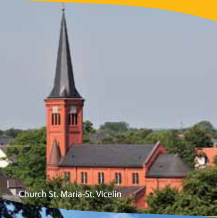
Church St. Maria-St. Vicelin

Please check online for the times of the church services for the different congregations (Protestant Lutheran, Roman Catholic, non-denominational) in Neumünster: www.kirche-nms.de