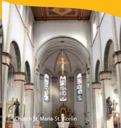
Church St. Maria-St. Vicelin